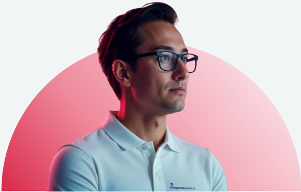
Designing and Deploying AI Solutions (Part 1: Process Automation)

Here's what you get to learn in this course