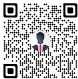
Watch us on YouTube