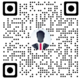
Follow us on Instagram