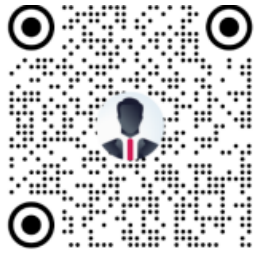
Like us on Facebook